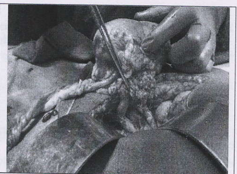
This hospital has also facilitated the family members of such Brain stem Dead patients.